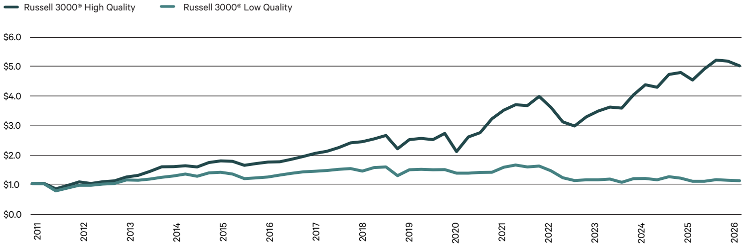
FIGURE 1: OUTPERFORMANCE OF HIGH-QUALITY STOCKS OVER 15-YEAR PERIOD (GROWTH OF $1,000,000)

Data as of March 31, 2026. High Quality and Low Quality are represented by the median of their respective universes. The Russell 3000® is not actively managed and does not reflect the deduction of any investment management or other fees and expenses. Indices are not available for direct investment. Past performance is no guarantee of future results.