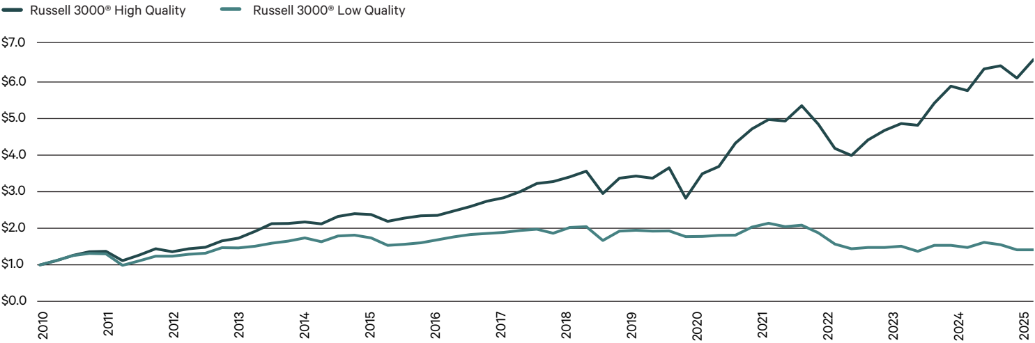
FIGURE 1: OUTPERFORMANCE OF HIGH-QUALITY STOCKS OVER 15-YEAR PERIOD (GROWTH OF $1,000,000)

Data presented is for the period ending June 30, 2025. High Quality and Low Quality are represented by the median of their respective universes. Data is obtained from FactSet Research Systems and is assumed to be reliable. The Russell 3000® is not actively managed and does not reflect the deduction of any investment management or other fees and expenses. Indices are not available for direct investment. Past performance is no guarantee of future results.